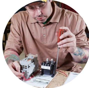
Industrial Certified Panel Shop