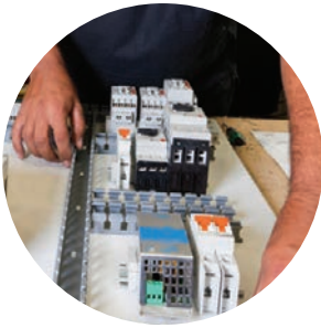
High Performing, Efficient Products