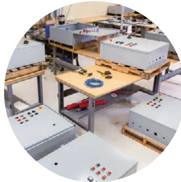
A Thriving Company in a Dynamic Industry