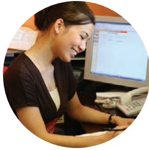
Exceptional Customer Service and Technical Support