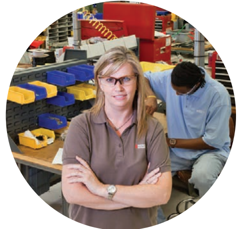
Leading Edge Manufacturing Facilities

We offer a wide range of products starting with high performing contactors and overload relays to robust power supplies and efficient disconnect switches.