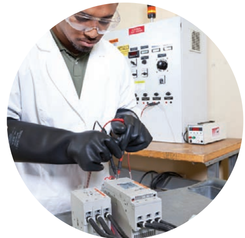
Engineering + Testing Services

We consistently work on improving our products and processes, maintaining industry standard certifications (national and international) in order to best serve you in all areas of your business. Sprecher + Schuh's elite panel shop is UL508A and cULus Approved as well and ISO 9001 certifications. We focus on quality , safety , reliability and efficiency .